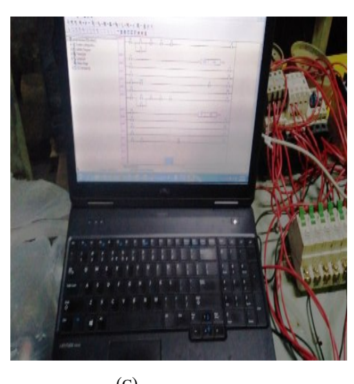
FIG 7.1 – (A) PLC SETUP IN BOILER, (B) BOILER SETUP, (C) OVERALL PLC CONNECTION AND OUTPUT

Steam boiler that is situated in the effluent treatment plant produces 600kg of steam when supplied with 600 liters of water. The steam generated in the boiler is given to the effluent treatment plant (ETP) to extract the total dissolved salts from the water by the use of the steam produced as the result of the operation of the steam boiler generator using programmable logic controller. The man power is reduced and it is various applications.